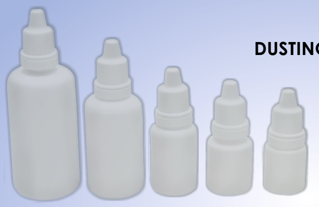
DUSTING POWDER 30 GMS