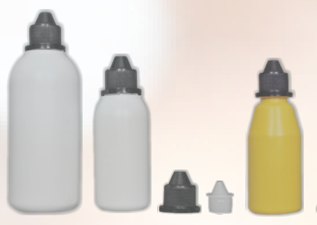
BETADINE & IODINE BOTTLE 100ML 250ML 500M