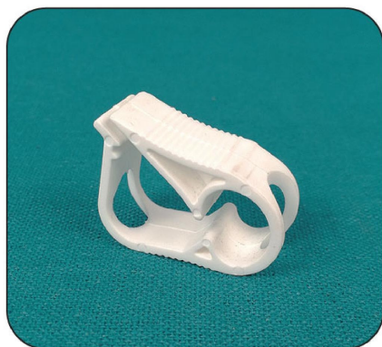
14000 - Pinch Clamp For Enema Tube