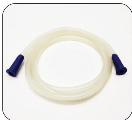
14024 - Enema Tube/Hose (Medical Grade PVC)