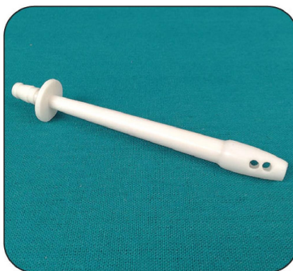
14013 - Retention Enema Nozzle (Medical Grade Silicone Tip)