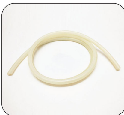
14025 - Enema Tube/Hose (Medical Grade Silicone)