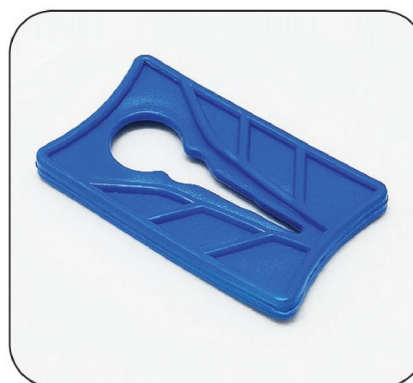
14026 - Enema Tube/Hose Clamp