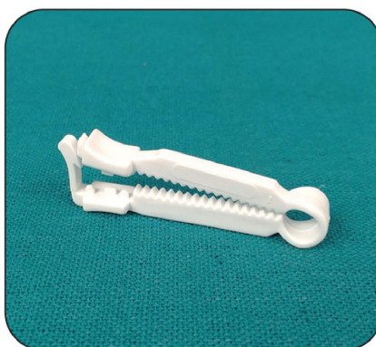
55009 - Umbilical Cord Clamp