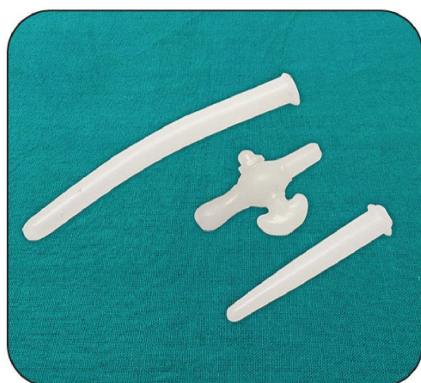
14014 - Tapped Enema Nozzle