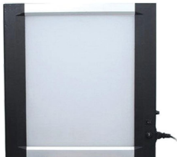
Item Code: 91000