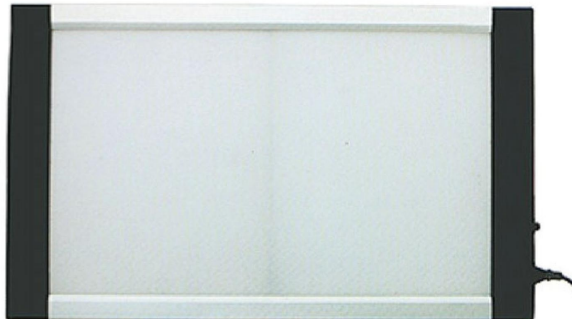
Item Code: 91001